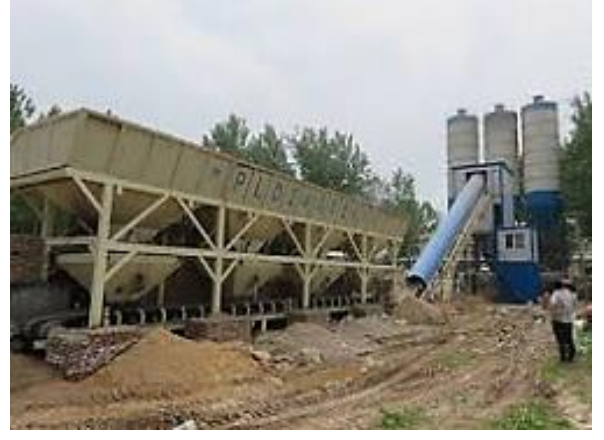
Figure 9.3 - Continuous Mixer (aka 'Pug Mill')

Continuous mixers (e.g. pugmills) ( Figure 9.3 ) are also used from time to time – mainly for the production of high volumes of low slump concrete (e.g. roller compacted concrete) for dam and road or hardstand construction.