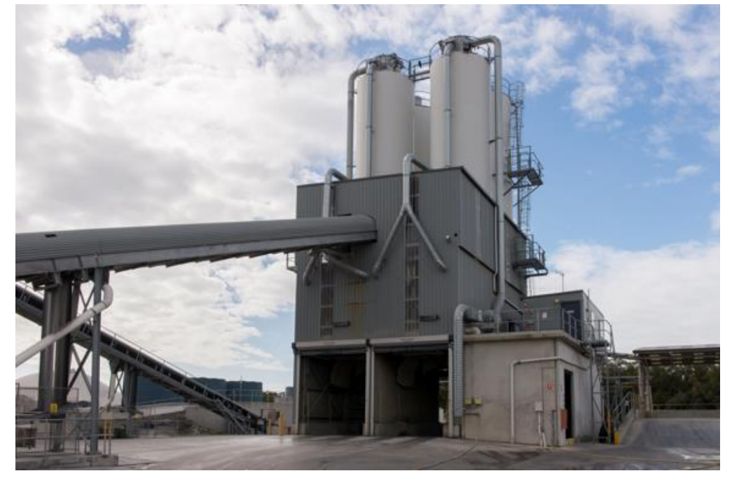
Figure 9.1 – Typical Modern Concrete Batching Plant

• Bin and silo contents must be clearly marked to prevent contamination when new loads are delivered.